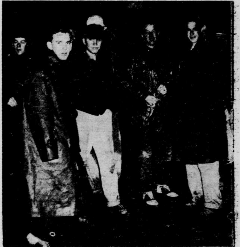
WHERE ARE THE Beavers? These freshmen were wondering at 2 a.m. Thursday as they waited in vain for an expected invasion from the north.

Finally, about 2:30 a.m., the police advised the frosh to "go home," and promised that they would watch for the Aggies.