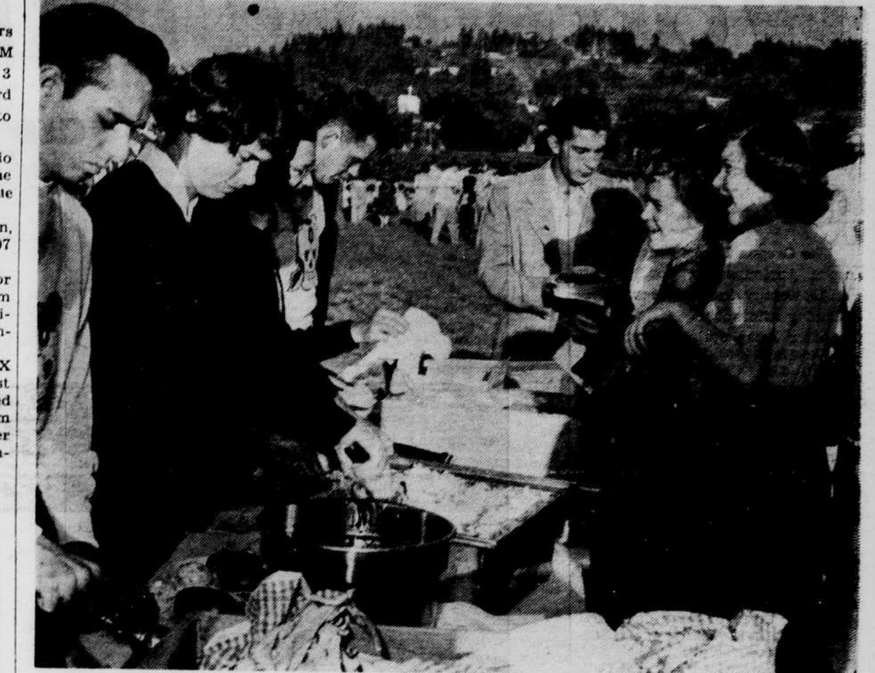
MEMBERS OF PHI THETA UPSILON and Skull and Dagger are shown as they served the food at the freshman picnic last Wednesday on Howe Field.