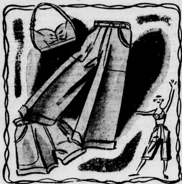
FADED BLUE DENIM SET WITH REVERSIBLE HALTER

98c 2.79 HALTER S.M.L. SHORT SLACKS 10-18