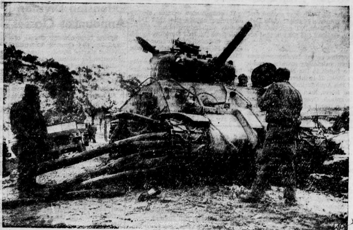
AN EIGHT-INCH GUN, manned by First Cavalry Division troopers, has just fired a round against the enemy on the west central front in Korea (Mar. 8). This big gun fires a 200 pound projectile 10 miles and has been very effective.