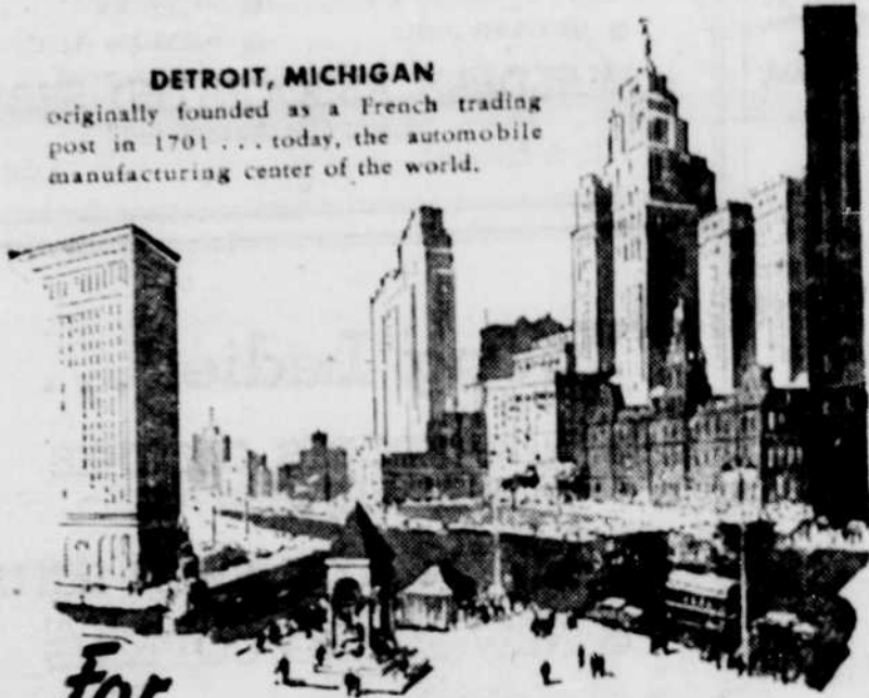
DETROIT, MICHIGAN originally founded as a French trading post in 1701... today, the automobile manufacturing center of the world.