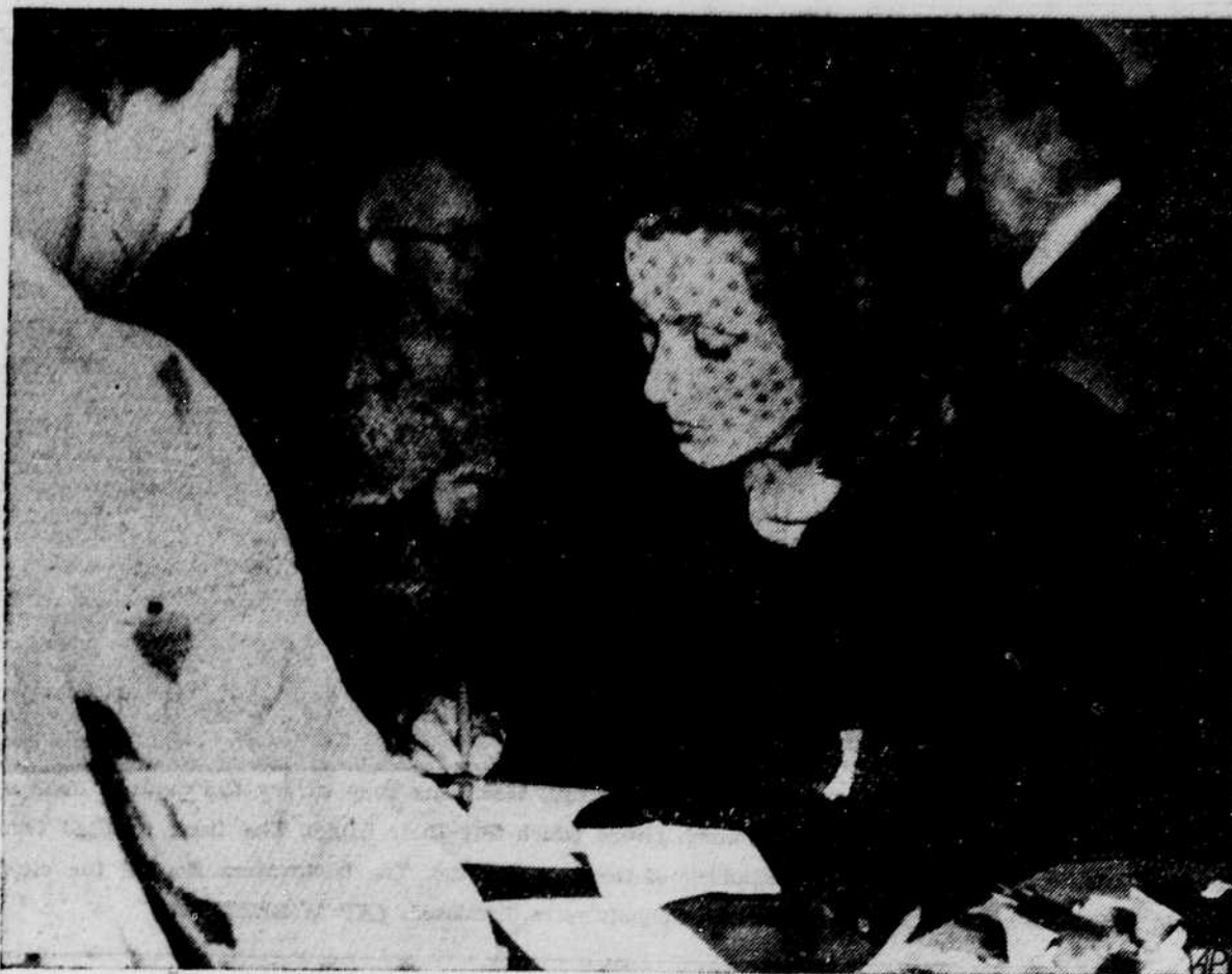
ACTRESS GRETA GARBO became an American citizen last week in the Los Angeles Federal Court, where she is pictured above signing the citizenship certificate. After taking the oath the noted Swedish actress hurried away without comment.