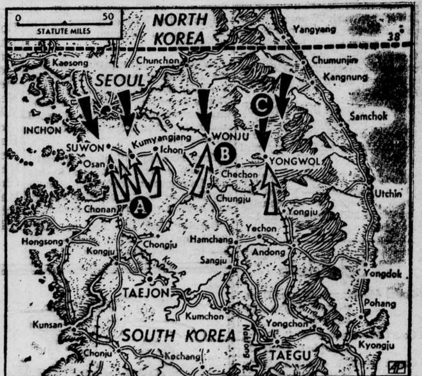
FOUR ALLIED COLUMNS with tanks and artillery made a reconnaissance in force and drove through Osan (A), Kumyangjang, approached Ichon and points between. Another patrol again seized Wonju (B). The striking forces returned to their man lines after failing to find any sizeable Communist force. East of Wonju an enemy force was attacking in Yongwol area (C).