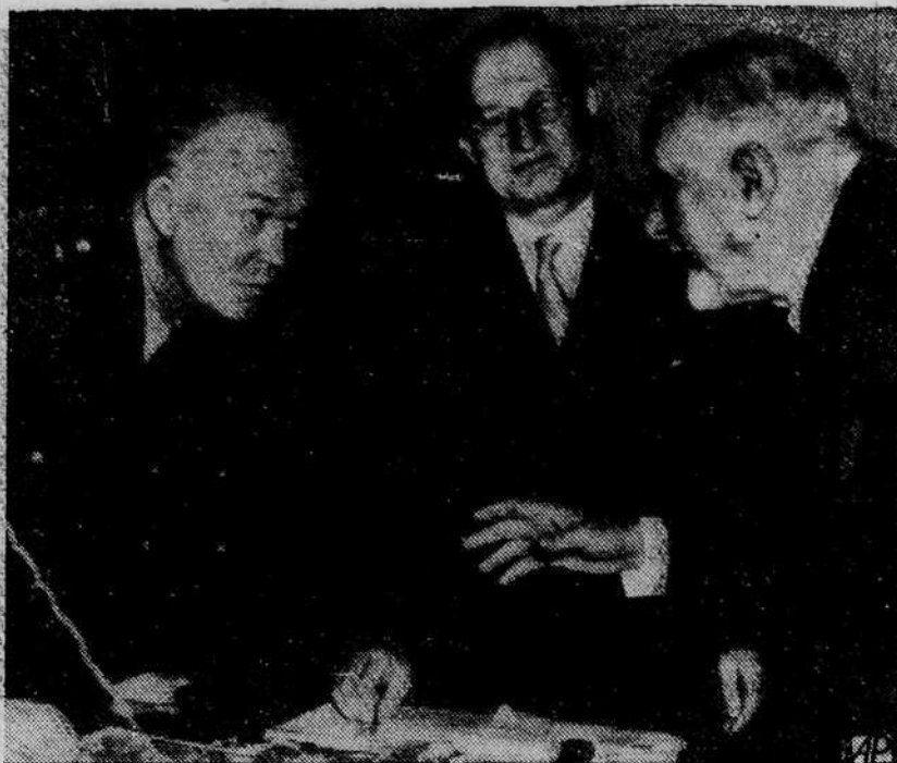
GEN. DWIGHT D. EISENHOWER (left) listens intently to Italian Foreign Minister Count Carlo Sforza (right) as they and Premier Alcide De Gasperi (center) meet in Rome's Viminale Palace to begin discussions on what part Italy will take in the defense of Western Europe. Meeting took place after Communist riots against Eisenhower's visit had caused one death and had brought injury to nearly 100 throughout Italy.