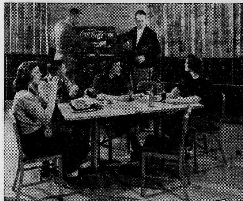
Associated Students Memorial Building University of Washington Seattle, Washington