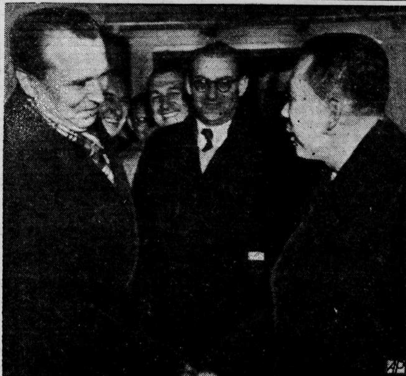
THE HEAD OF THE Chinese Communist delegation, Wu Hsiu-Chuan (right) is greeted by Russia's Jacob Mallk (left) as the Chinese arrived at Idlewild airport, New York, from London. In center background is Juliusz Katz-Suchy, head of the Polish U. N. delegation. The Chinese Communist delegation is here for talks at the United Nations Security Council.

While rejecting the request for KDUK, the FCC has as yet not given approval to any other call letters. KDUK and KWAC were also listed by the station as call-letter choices.