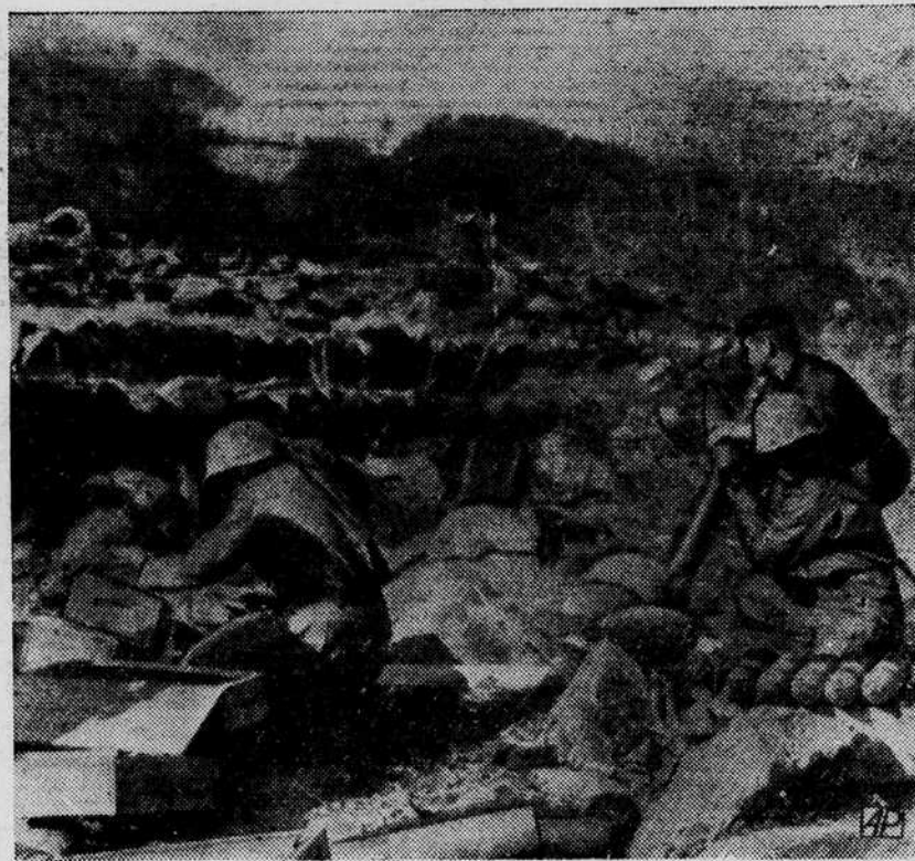
SMOKE BURSTS BLOSSOM on enemy hill positions north of Hamhung, North Korea, as United States Marine mortar crews keep a steady pressure on the Reds. The marines were moving steadily toward the big Changjin power dam in this sector.