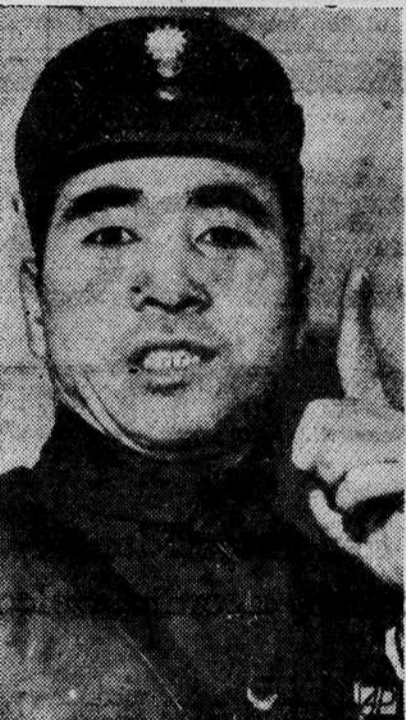
GENERAL LIN PIAO, one of the most successful commanders in the Communist victory over the Chinese Nationalists, now commands an estimated 600,000 Red troops in Manchuria and North China. These troops could be used to support Chinese Communists now fighting in North Korea.