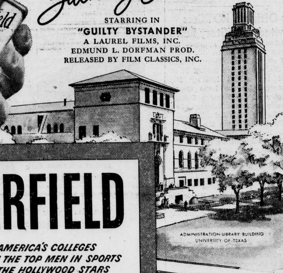
ADMINISTRATION LIBRARY BUILDING UNIVERSITY OF TEXAS