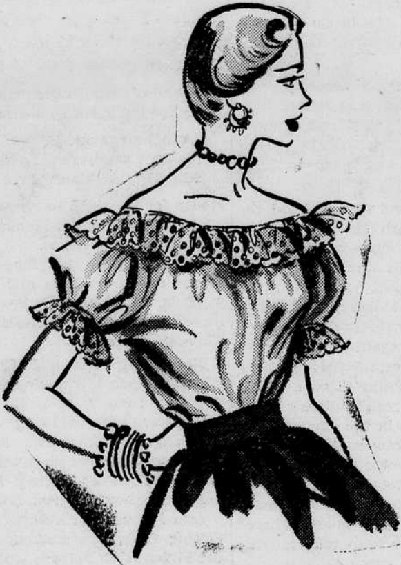
"ON OR OFF THE SHOULDER" BLOUSE

Outstanding style for summer! Elas- tic neck and sleeve openings. Lovely, fluffy tier of embroidery eyelet trims the yoke from shoulder to shoulder. Same trimming gives finishing touch to puffed sleeves. Sizes, 32 to 38