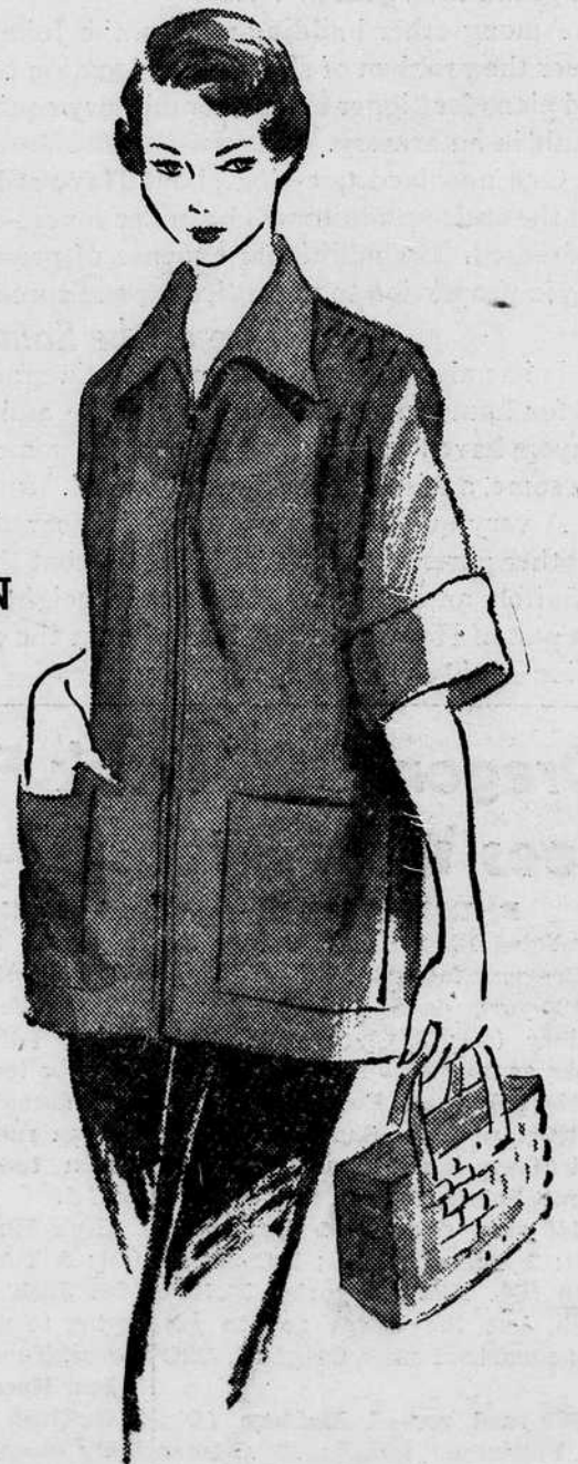
BROWN RED BLUE GREEN

Rich, multi-color batik prints on solid color background.—Made in Califor- nia it's perfect for 'round-the-campus or date wear. Graceful and good- looking! Sizes 24 to 28. . . . . 3.98