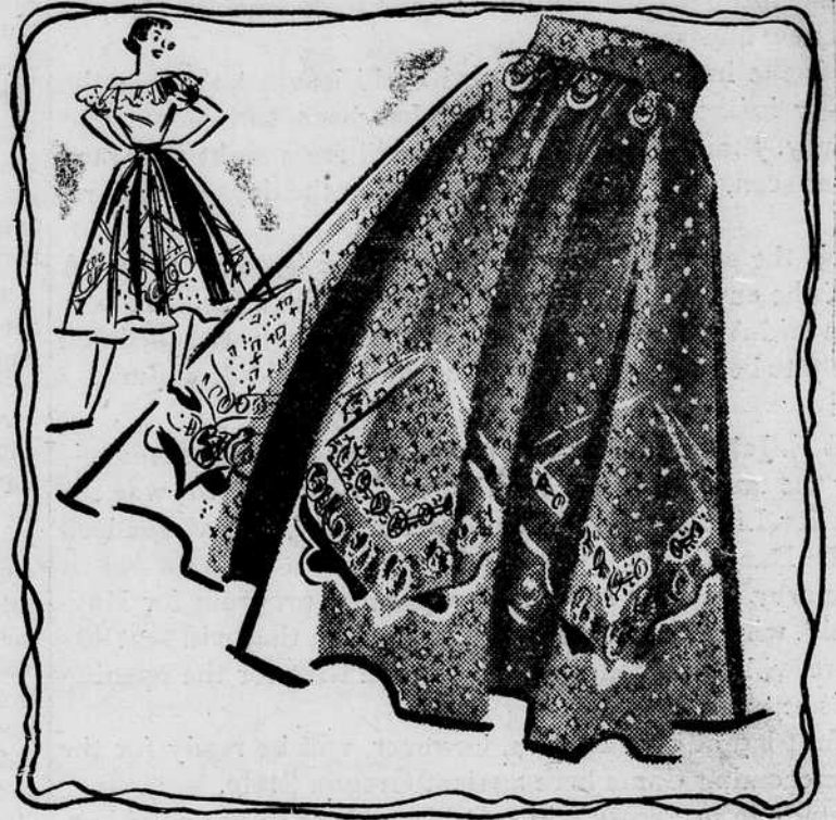
BATIK PRINT SKIRTS

Rich, multi-color batik prints on solid color background.—Made in Califor- nia it's perfect for 'round-the-campus or date wear. Graceful and good- looking! Sizes 24 to 28. . . . . 3.98