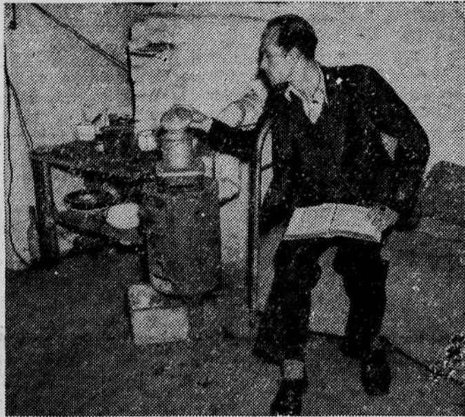
Some 2000 refugees are enrolled in European universities, while the U.N. International Refugee Organization seeks homes for them. At the left, refugees use a basement library in a bombed-out building. At the right, a student cooks in his tiny bedroom-study-living room.

Oregon's part in helping such students as shown above is brought closer home this week during the official World Student Fund drive, which starts today.