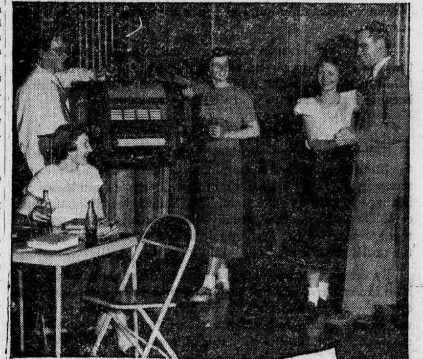
Grand Rapids Room University, Michigan (Ann Arbor)