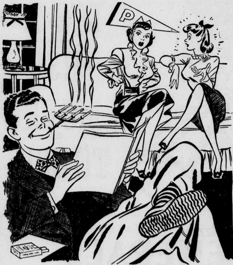
"It's no use, Mary, he's been like that since he discovered there's NO CIGARETTE HANGOVER when you smoke Philip Morris."