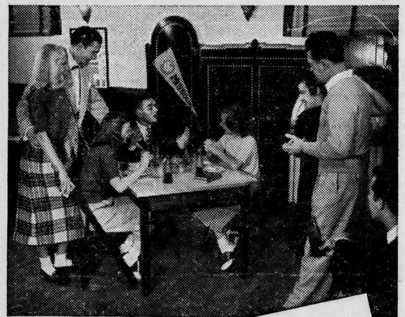
Gaebler's Black and Gold Inn, Columbia, Mo.