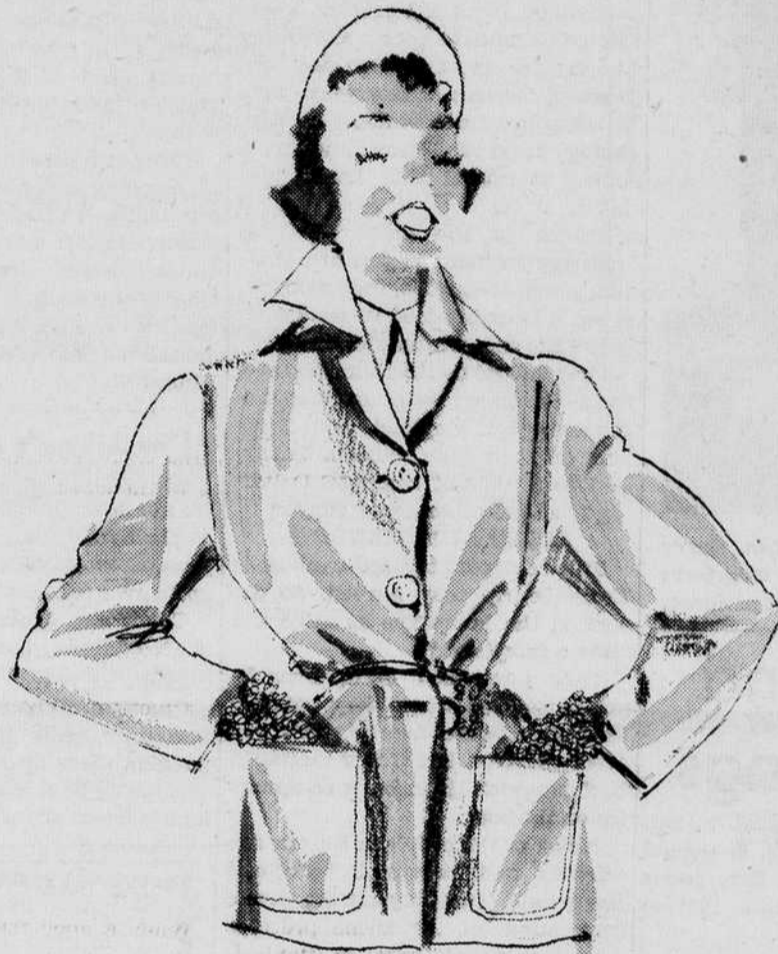
Oregon's Own Pendleton Jacket!