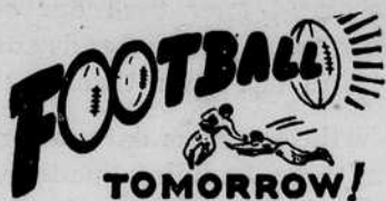
Ducks vs. Huskies