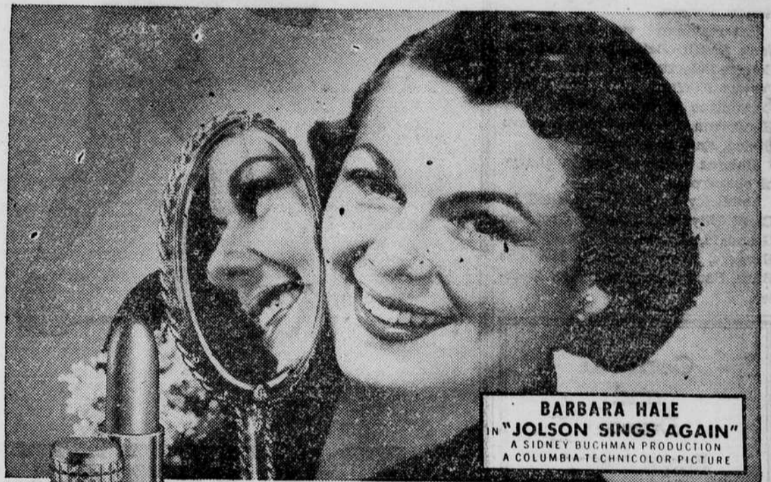
BARBARA HALE IN "JOLSON SINGS AGAIN" A SIDNEY BUCHMAN PRODUCTION A COLUMBIA TECHNICOLOR PICTURE

never, never before LIP COLORS LIKE THESE