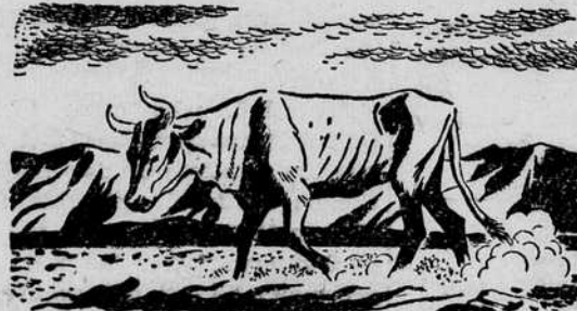
Each year range fires burn millions of acres of land bearing essential grain and livestock feed!

Range fires are murder—any way you look at them! Here's what they do to this country—your country—EVERY YEAR.