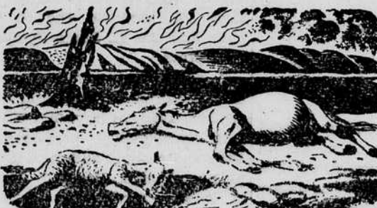
They kill cows, horses, sheep and wildlife!