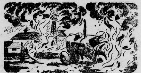
They destroy homes, farm buildings and equipment—sometimes entire communities!