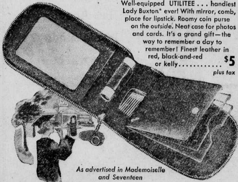
As advertised in Mademoiselle and Seventeen

Well-equipped UTILITEE... handiest Lady Buxton" ever! With mirror, comb, place for lipstick. Roomy coin purse on the outside. Neat case for photos and cards. It's a grand gift—the way to remember a day to remember! Finest leather in red, black-and-red or kelly..... $5 plus tax