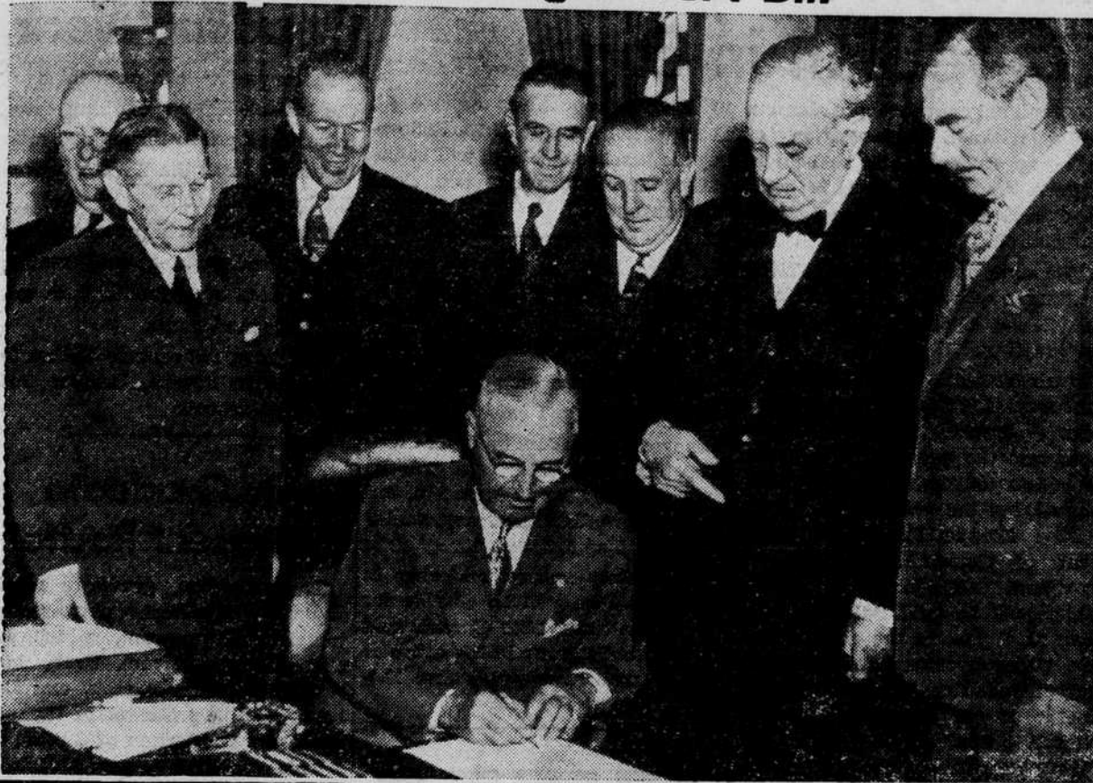
PRESIDENT TRUMAN signs the $5,580,000,000 (b) European Recovery Authorization bill.