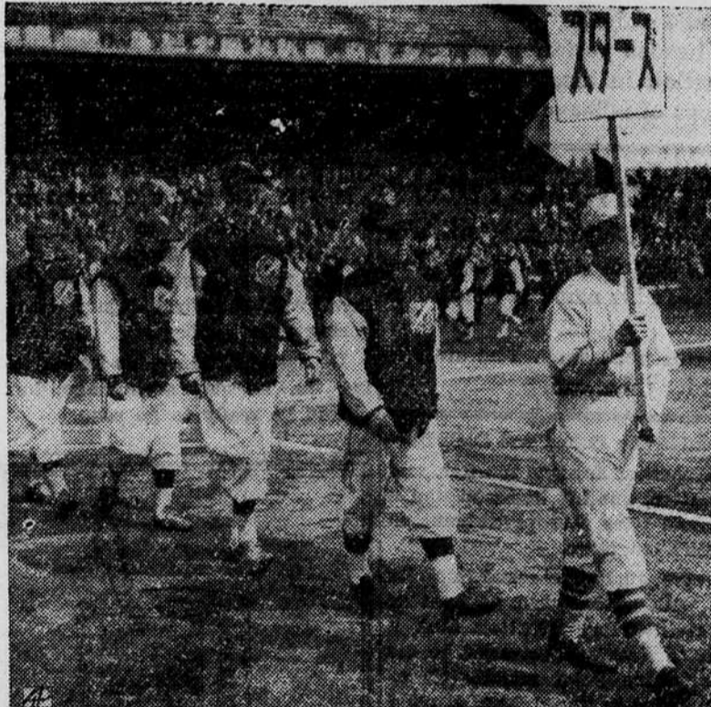
So that the spectators will know who's playing, a mascot carries the name of his team in front of a string of Japanese baseball players as they parade on opening day in Tokyo.