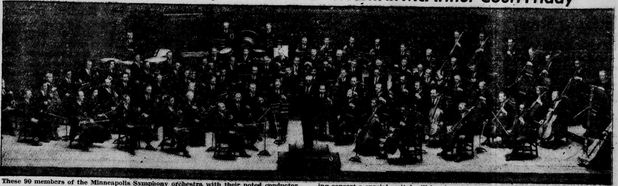
These 90 members of the Minneapolis Symphony orchestra with their noted conductor Dimitri Mitropoulos will appear for the second time in McArthur court this Friday at 8:15 p. m. Students need only show registration cards for entrance. In addition to this even-

ing concert a special recital will be given by some members of the group Friday afternoon at 4:15 in the music school auditorium. The orchestra's last visit to Eugene was in 1947. See story on page 1.