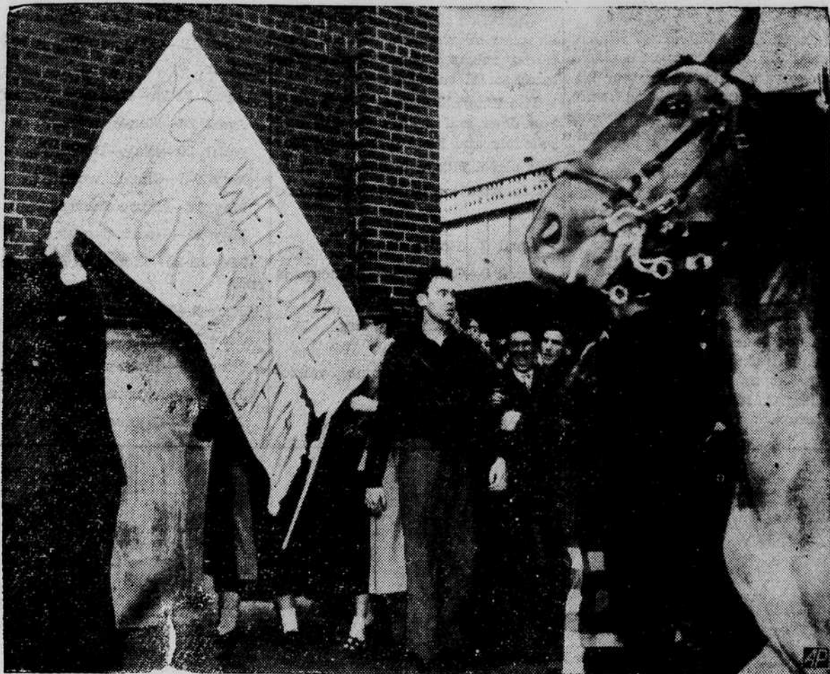
A POLICEMAN APPROACHES pickets demonstrating along New York City's 12th avenue, protesting the arrival of Ernest Bevin, British foreign minister. The demonstration was staged by representatives of the Joint Committee to Combat anti-Semitism.