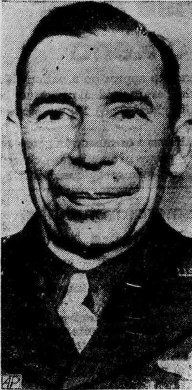
Charges of an unspecified nature have been preferred against Gen. Clayton L. Bissell (above) it was announced in Frankfurt, Germany, by headquarters of the United States air force in Europe. The charges are being investigated to determine if they warrant a trial by courtmartial.

Admiration must be expressed for anybody who can remember enough of what happened at the cocktail party to testify about it in court.