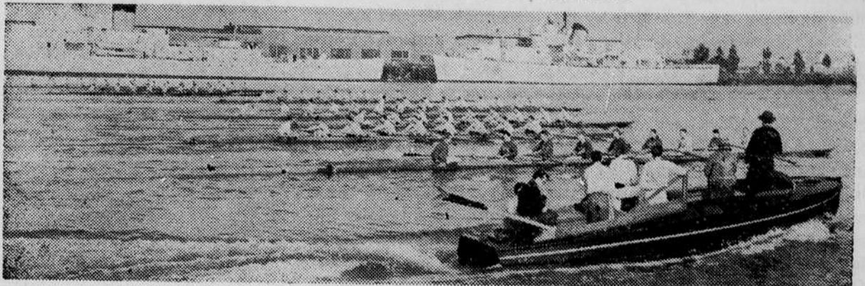
Eight boatloads of University of California crew men limber up on the Oakland Estuary in a short sprint under the watchful eye of coach Ky Ebright (standing in launch) during opening day of crew practice.