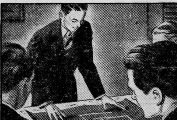
2,100—That's the number of people in the American Telephone and Telegraph Company. Through advice and assistance, they coordinate the activities of the entire Bell System.

In all, there are some 682,000 men and women in the Bell System. As this country's communications service is expanded and improved, opportunities will grow still greater. There's a future in telephony.