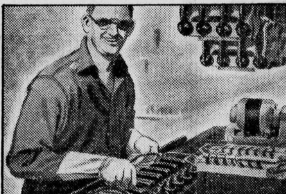
131,400—This numbers the employees of the Western Electric Company who manufacture, purchase and distribute equipment and supplies for the entire Bell System.