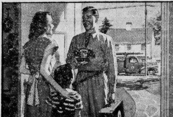
516,500—It takes this number of men and women to operate the twenty-two Bell Telephone Companies. Each operating company is responsible for furnishing telephone service within its own territory.

Some telephone numbers you ought to know