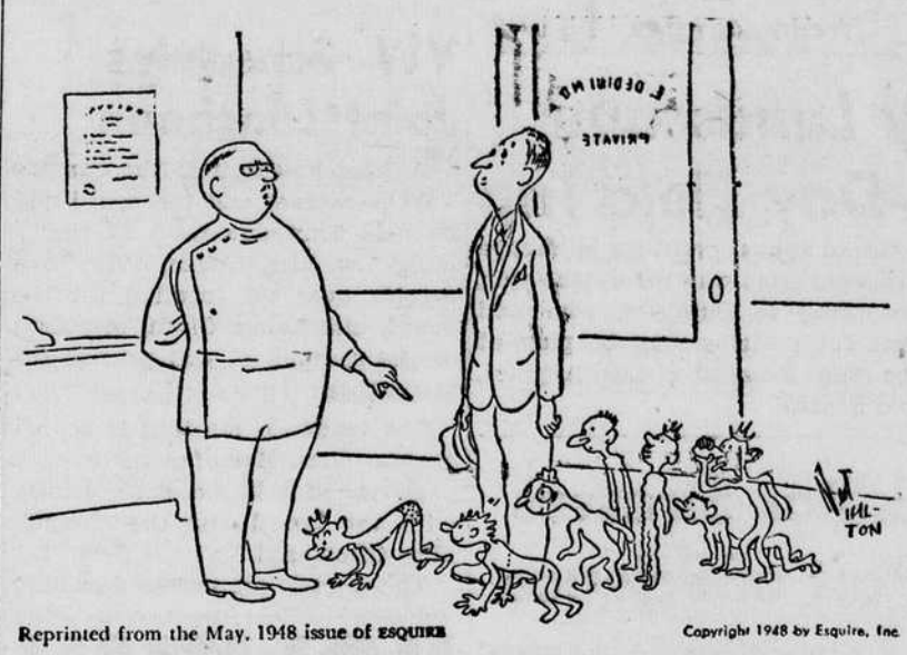
"I must insist that your little friends wait outside while I treat your case"