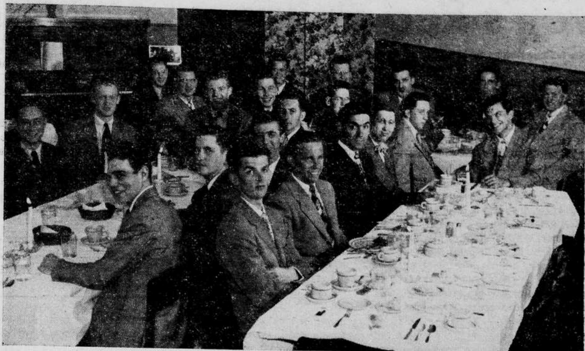
Members of the University W. F. G. Thacher chapter of Alpha Delta Sigma, professional men's advertising fraternity, are shown as they gathered Tuesday night for their annual banquet. Highlights of the evening were the initiation of seven men and the drawing up of plans to award a special advertising scholarship to the outstanding junior in advertising.