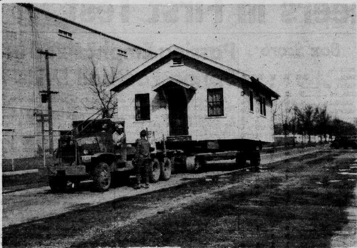
To make room for the new women's dormitory it was necessary to move several houses from the site south of Emerald hall. The house shown above weighed four tons. (Courtesy Register-Guard).