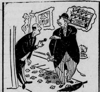
"DON'T FORGET YOUR DR. GRABOW PRE-SMOKED PIPE, SIR"