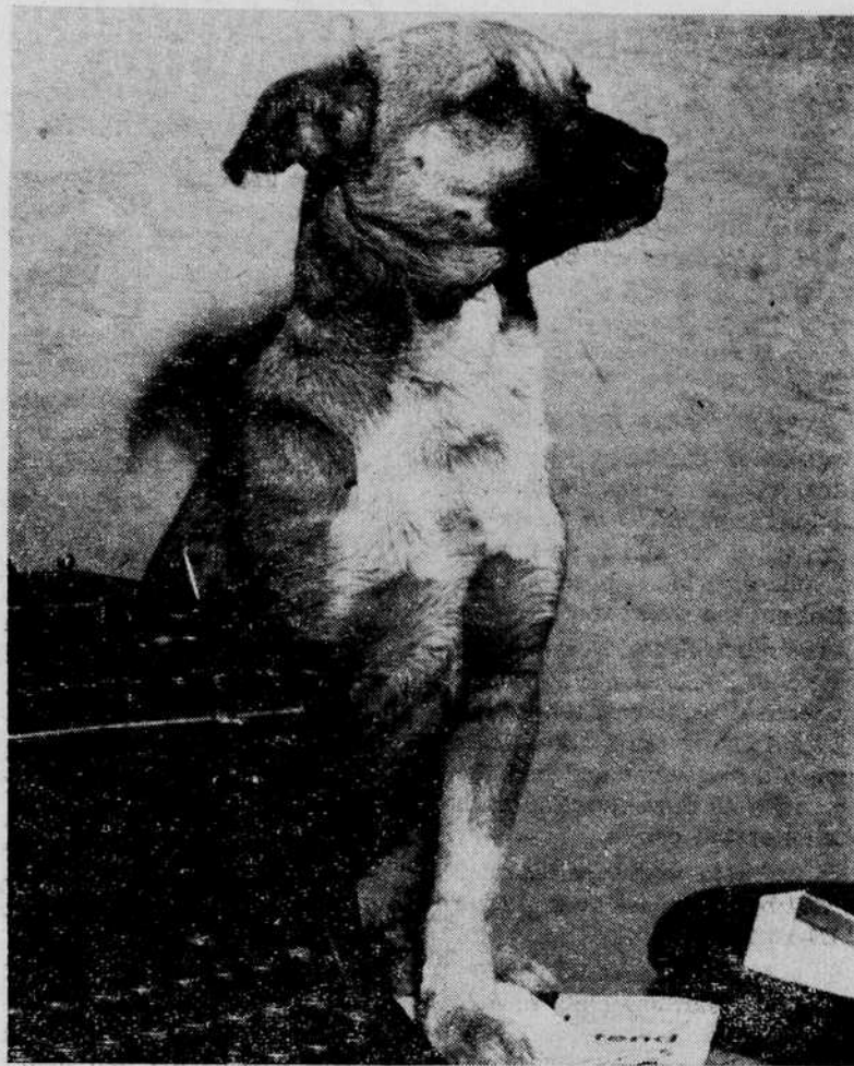
This little dog is the only living creature who has crossed the news editors' paths this year without asking for anything. To him we point with pride!

asked U. S. district court to declare unconstitutional the political expenditures ban of the Taft-Hartley labor law.