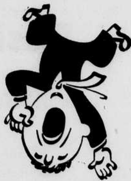
Bill Barnum "Rooter"

Seaforth, 10 Rockefeller Plaza, N. Y. 20