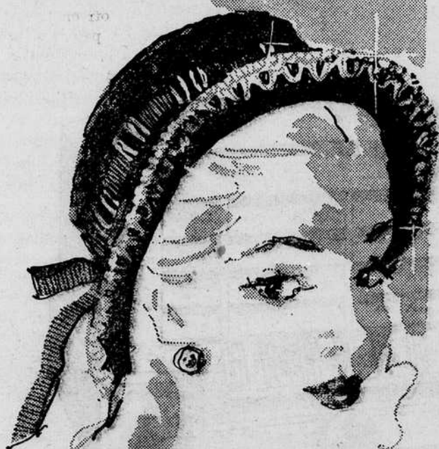
CROCHETED felt fired with GOLDEN GLITTER... it's