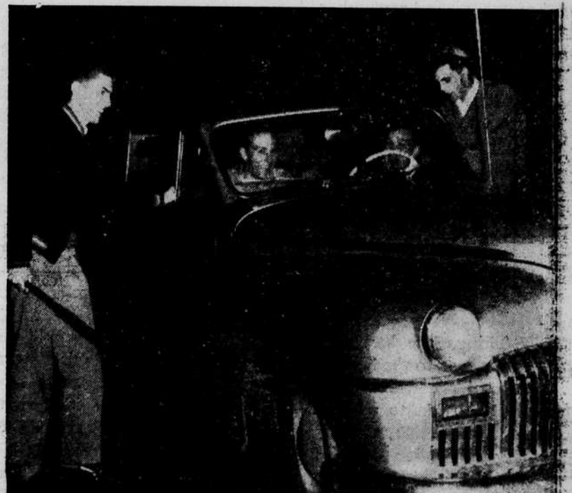
Lucky for the two in the convertible they are not from Oregon State as they are stopped by two student guards—part of a cordon thrown around the campus this week to protect it against Aggie vandalism.