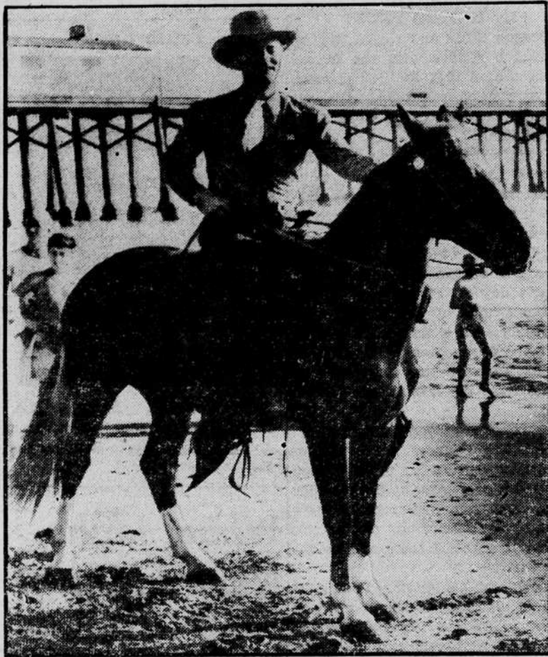
Idaho's singing Sen. Glen Taylor sits on his sorrel horse "Nugget" at Seal Beach, Calif., at outset of his "Paul Revere" ride across the country—destination New York—to inform the nation that war is coming under the State Department's foreign policy.