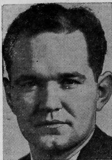
His lads hit UCLA Saturday.