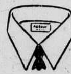
"BROCKLY" Medium point collar