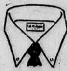
"DOVER" Roll front button-down