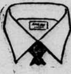
"SUSSEX" Widestread stay collar