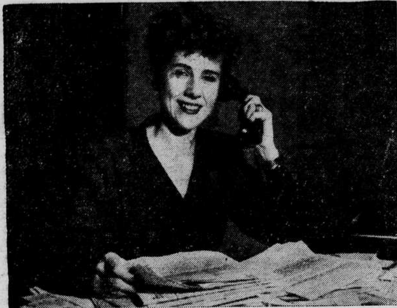
Whenever Clare Boothe Luce steps upon a platform a lively debating session is in prospect. The brilliant playwright and former Congresswoman from Connecticut is scheduled to appear on two consecutive broadcasts of "America's Town Meeting" over ABC. She will be heard on Tuesday, October 7, and again on Tuesday, October 14.