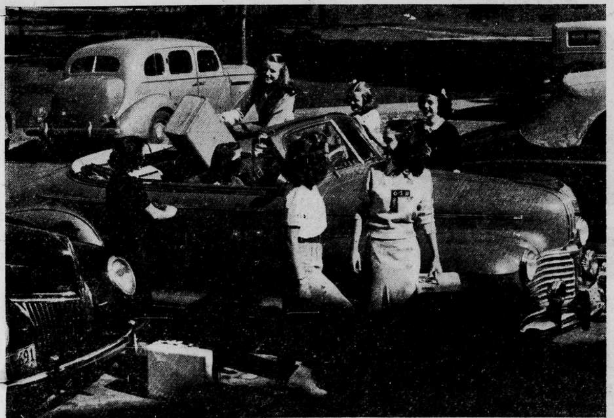
- EMERALD photo by Don Jones.

The assembly, which will be broadcast at 7:30 p.m. from McArthur court, will open the campaign for $5000 to be raised by May 10. One of the main events of the assembly will be the on-the-spot drawing of one woman's and one man's living organization to sing before the assembly, the women singing "As I Sit and Dream at Evening" and the men singing "Oregon" and it will be done without previous notice. Each living organization is required to have as many students there as possible in the event their houses will be drawn.