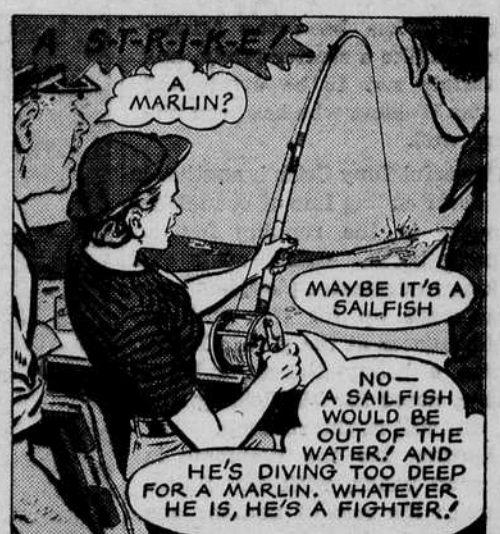
R. J. Reynolds Tobacco Company, Winston-Salem, North Carolina