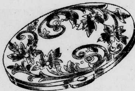
Ladylike white enamel with swirling gold* leaf design. 3.25.

IT'S WEISFIELD'S FOR the Northwest's most complete assortment of elegant new COMPACTS BY Elgin American