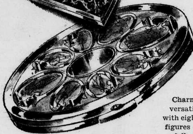
Charming conversation piece with eight fashion figures etched on dull-and-bright gold finish.* 6.95