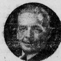
IN THE HAND OF ALBERT SPALDING World-famous concert violinist and composer.

"INFORMATION, PLEASE" Listen in every Wednesday night 10:30 EST • CBS, coast-to-coast