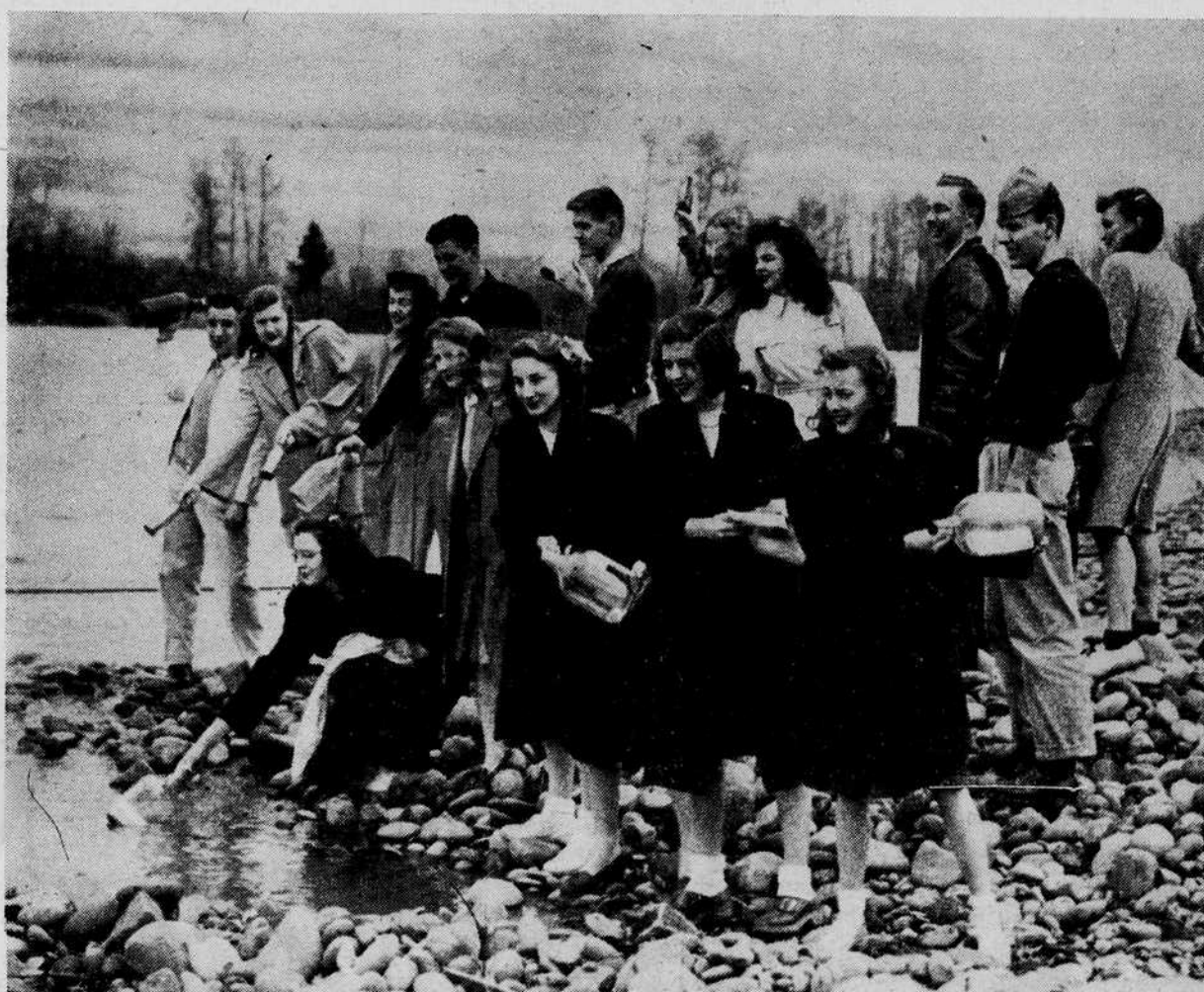
FLOATIN' O'ER THE FOAM . . . Down the Willamette, these bottles, containing invitations to Dad for the coming Dads' Day, are about to sent on their way. Festivities begin Saturday with registration at Johnson hall. See story page 3.