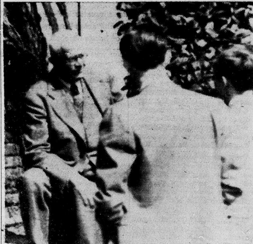
CARL VAN DOREN