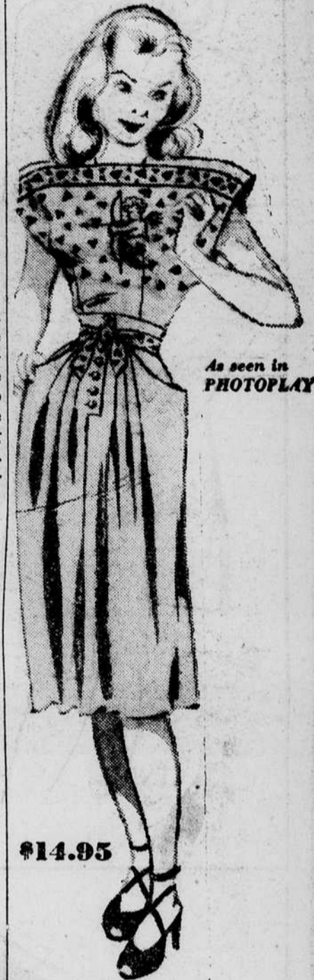
As seen in PHOTOPLAY