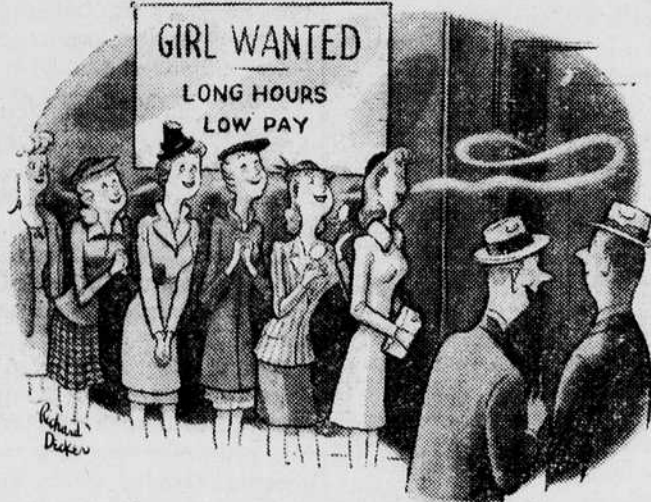
"The boss smokes Sir Walter Raleigh."